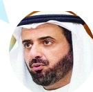
H.E. Dr. Tawfeek AlRabeah Minister of Health Kingdom of Saudi Arabia

“ I am very pleased to join this course, have learned a lot and found this course very interesting. The quality of the global speakers, participants and the interaction with them was a great help for me to learn more. The mix of program activities, case studies and Q&A has helped me in the arena of leadership and decision making Having a great education in a great place like Madinah is the best one can hope for ”